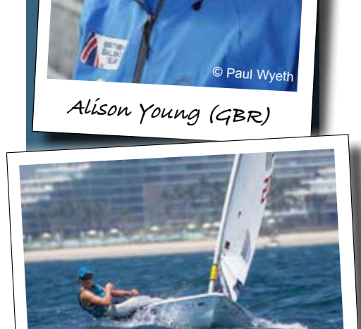
2016 Laser Radíal Women's World Championship, Mexico

Find a good coach - someone you can communicate and work well with, keep challenging yourself and enjoy it!