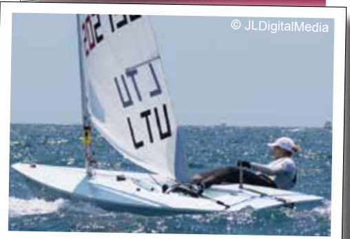
2016 Laser Radíal Women's World Championship, Mexico

Laser Radial Women's world Champion 2012