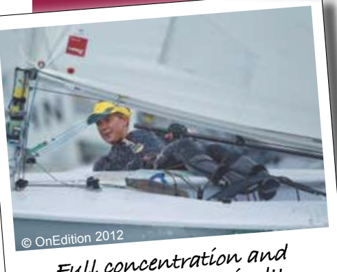
Full concentration and hiking hard upwind!!