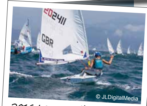
2016 Laser Radíal Women's World Champíonshíp, Mexíco