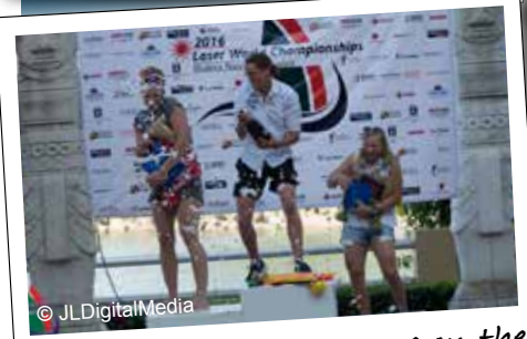
Sharing the champagne on the podium in Mexico!